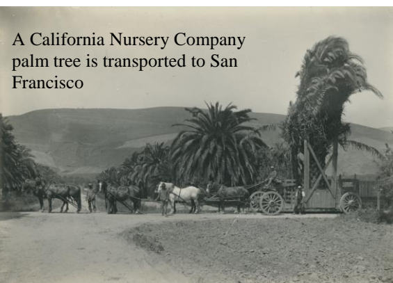
A California Nursery Company palm tree is transported to San Francisco

In 2015 we celebrate 100 years since the famous Panama Pacific International Exposition, held in San Francisco in 1915. All over the bay area and beyond organizations are clamoring to create displays commemorating this exciting event. Did you know that our very own California Nursery Company sent palm trees to the Exposition from their location here in Niles? Here in the Tri-City area there are quite a few groups who are working