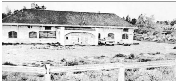
Garden of Allah, late 60's early 70's

We encourage you to spend some time learning about two local historical sites, on which a great deal of information has recently been added to the website: