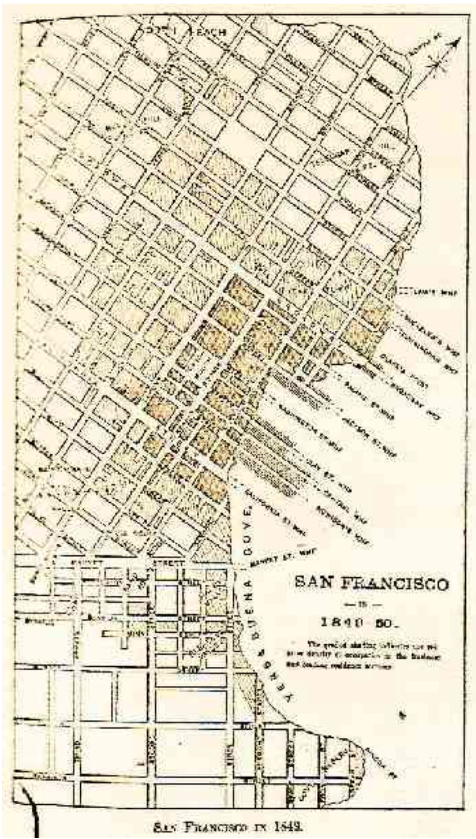
(Map showing location of wharfs at end of Jackson St. Yerba Buena Cove was filled and is now covered with buildings)