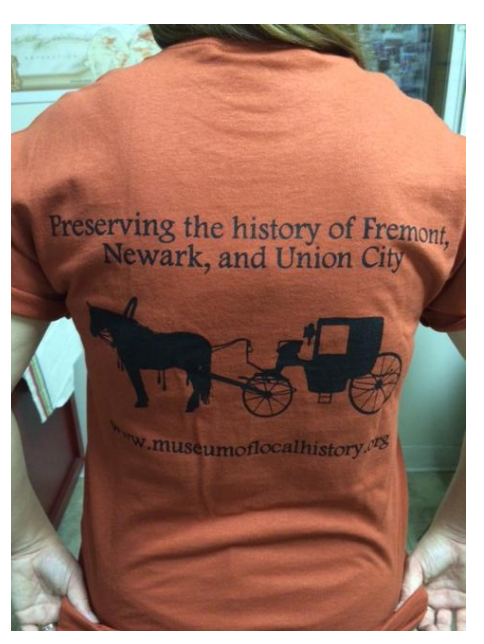
REMINDER: The museum will be closed from December 24th through January 2nd. Enjoy the holidays!

This year we are happy to offer t-shirts to all of our members! If you are interested in obtaining a t-shirt please notate what size on your membership form and include an extra $15 on top of your dues ($10 for the t-shirt and $5 for shipping). The t-shirt will be shipped to the address we have on file for you. T-shirts are rust colored.