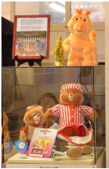
Teddy Ruxpin Exhibit