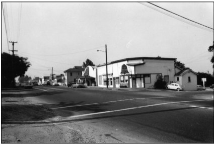
Downtown Mission San Jose. Circa 1970s